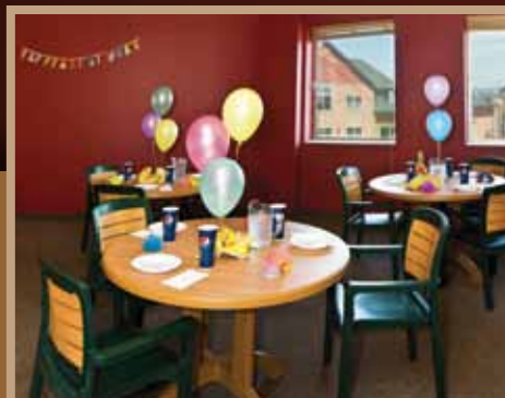
PAUL & BABE'S ROOMS