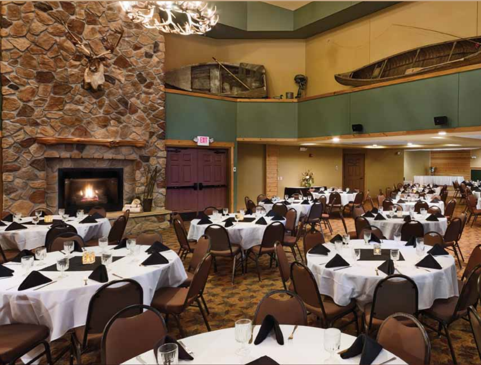
RED & WHITE SAND BALLROOM