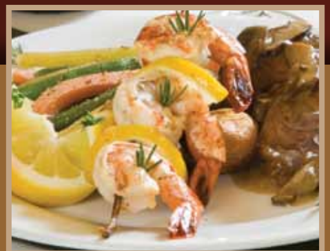
AWARD WINNING CUISINE