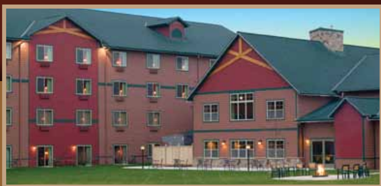
OUTDOOR PATIO & FIREPIT AREA