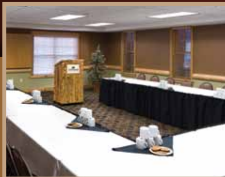
BAIT & TACKLE MEETING ROOM