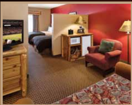
STANDARD DOUBLE QUEEN