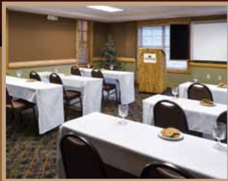
FLEXIBLE MEETING SPACE