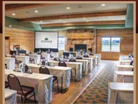
RED SANDS BALLROOM