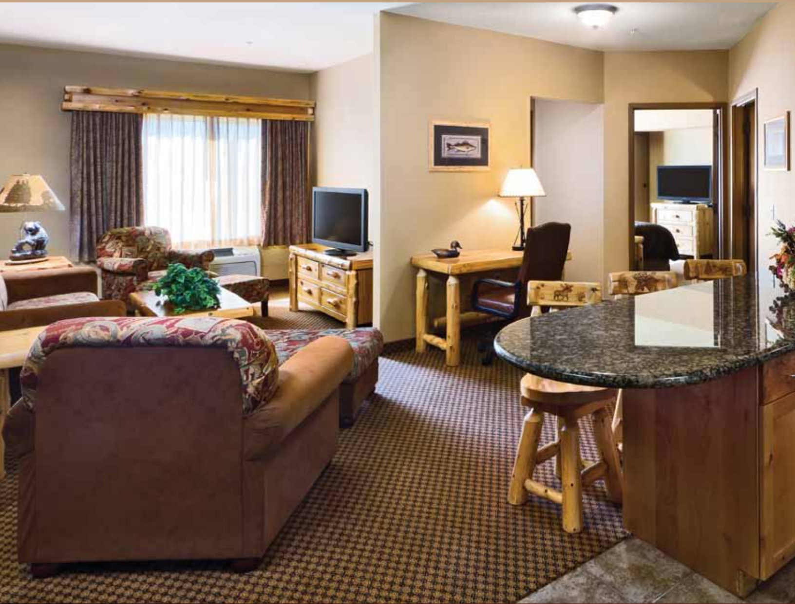
2-BEDROOM KITCHEN SUITE