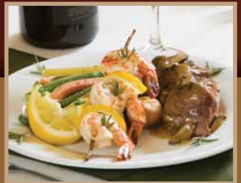
AWARD WINNING CUISINE