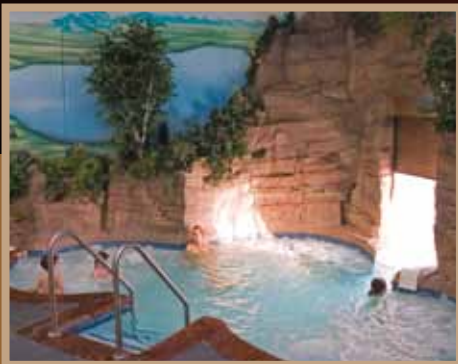
INDOOR / OUTDOOR WHIRLPOOL